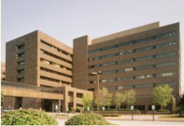
8402 HARCOURT ROAD