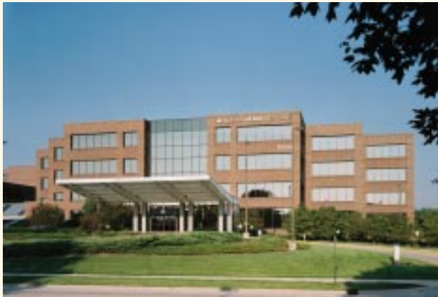
8333 NAAB ROAD