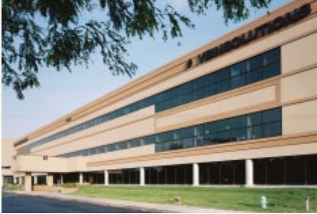
Medical Office Building I