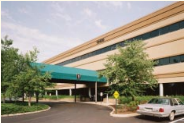
Medical Office Building II