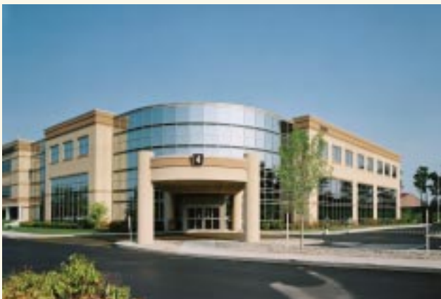
Medical Office Building III