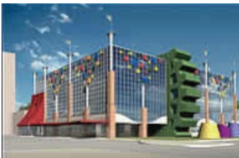
Peyton Manning Children's Hospital at St. Vincent

St. Vincent Health was selected in 2007 by the Indianapolis Star as one of the Best Places to Work.