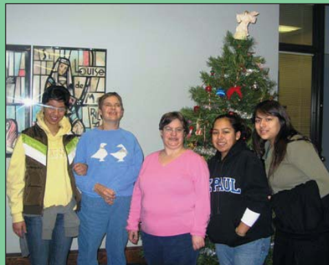
De Paul University students, in Indianapolis for the fall Immersion Ministry program, helped individuals in the Day Services program put up and decorate a Christmas tree at the New Hope offices.