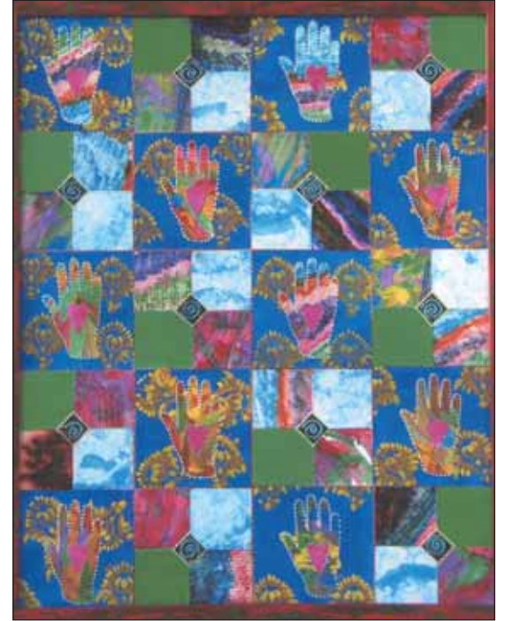
"Warm Wishes"

The artists are happy to share their work with you during this holiday season. They also send their "Warm Wishes" for a happy holiday from St. Vincent New Hope.