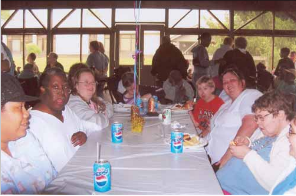
Individuals who reside at Laboure and Frederic group homes joined other group home residents, associates and Northwest Kiwanis Club members for the annual group home cook-out. This year the event was combined with the Group Home Council Carnival. Everyone enjoyed the food and fun!