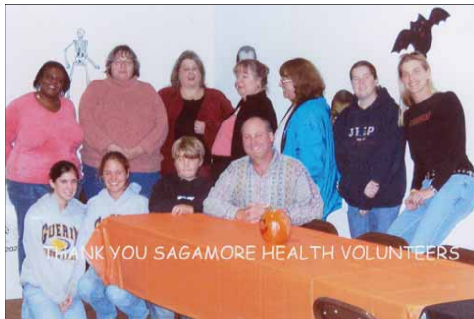
Sagamore Health Network volunteers relax after decorating the hall.