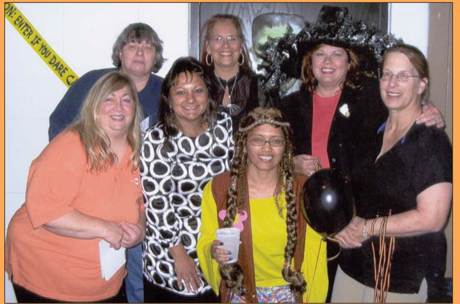
Thanks to Sagamore Health Network and the volunteers for another great party!