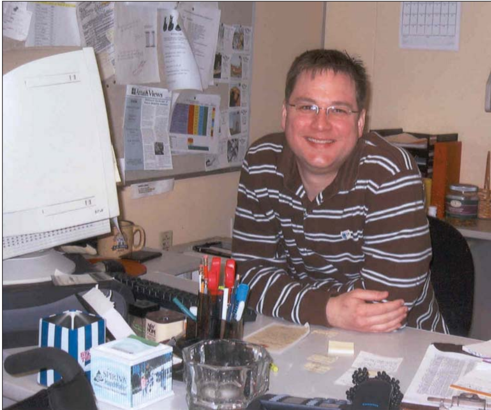
I love my job!