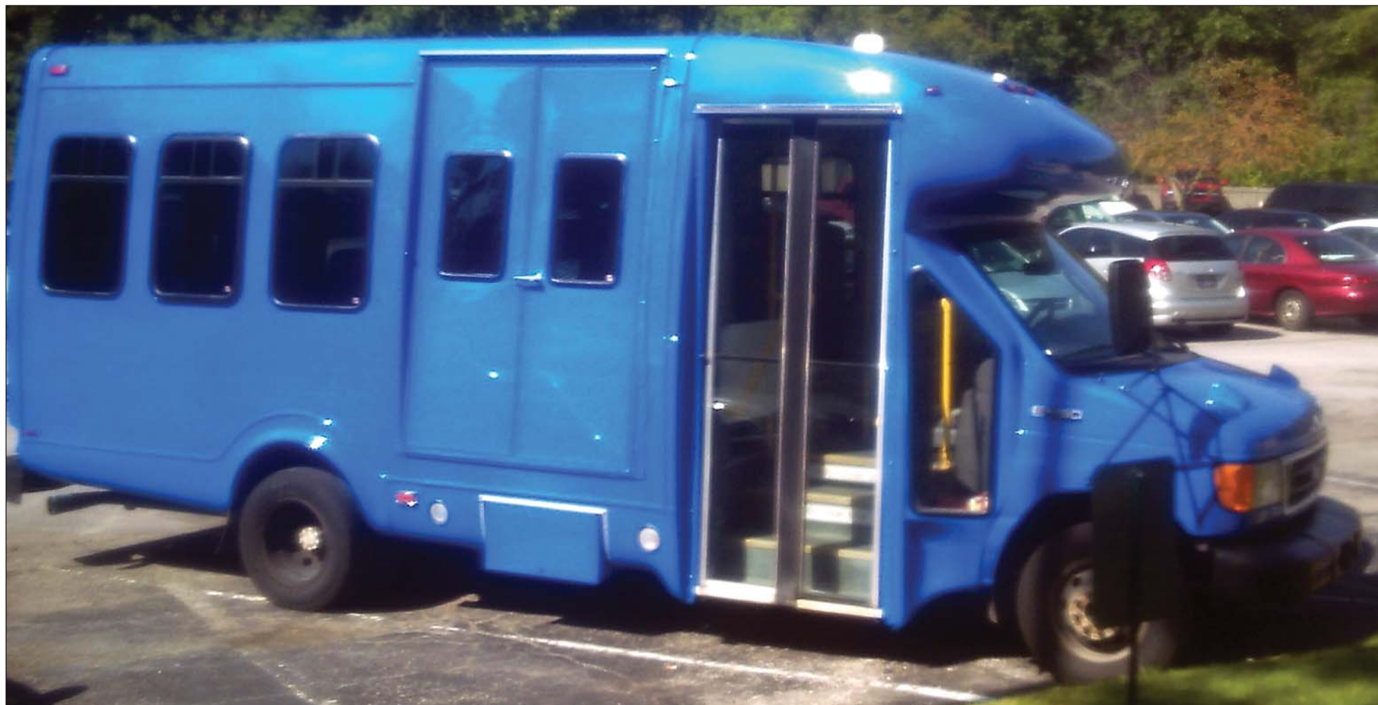
Day Services loves the Blueberry! St.Vincent New Hope Day Services is grateful for Open Door's donation of the bus affectionately known as Blueberry.